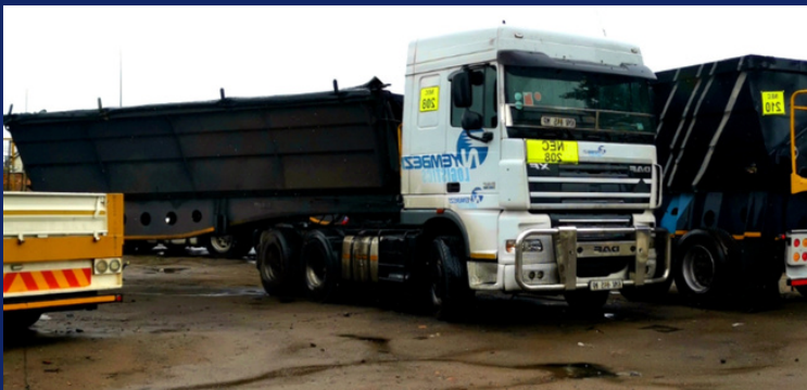
3 X 34 ton Side Tippers

In our robust fleet, we proudly feature 5 cutting-edge 34-ton side tipper trucks and an additional 5 flat deck truck and trailers, each meticulously maintained to deliver optimal performance. Operating across the diverse landscapes of South Africa, our logistics network spans every province, ensuring comprehensive coverage and timely deliveries. Going beyond national boundaries, our reach extends into the neighboring countries of Mozambique and Swaziland.