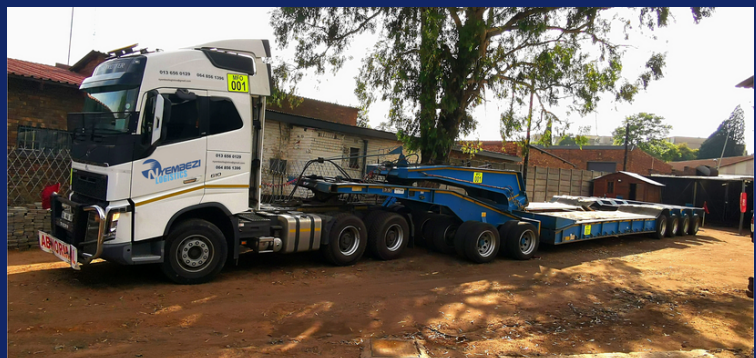
2 X 130 ton Lowbed Trucks